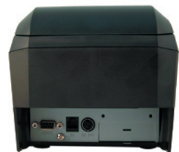
Default with serial interface, option for parallel ,USB or LAN interface by plug in module