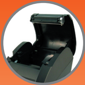
Drop-and-load structure for paper roll loading