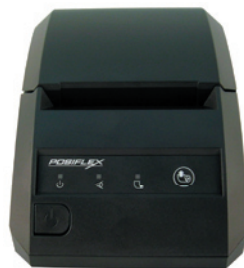
Multi-color indicator to show the status of printer