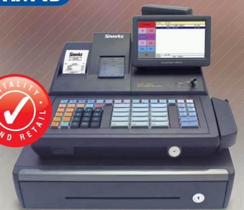
SPS-520 ECR TOUCH SCREEN POS SYSTEM