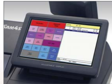
■ The SPS-500 Series has a 7" Touch Screen Operator Display.

Featuring a hybrid design, Sam4s has combined fast and simple ECR keyboard entry with an intuitive touch screen operator display.