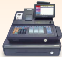
SAM4s ■ SPS-520 Twin Station 58mm Thermal Printer (Raised or Flat K/B)