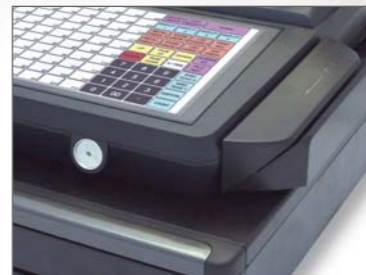
■ The SPS-500 Series has Magnetic Dallas & (Opt.) Mag Card Reader.