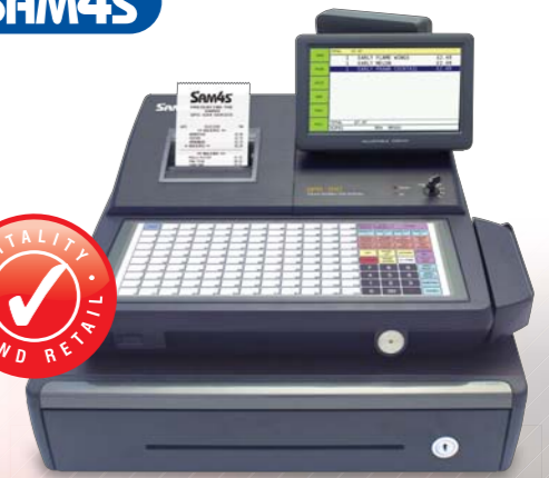
SPS-530 ECR TOUCH SCREEN POS SYSTEM