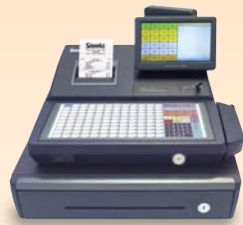
SAM4s ■ SPS-530 Single Station 80mm Thermal Printer (Raised or Flat K/B)