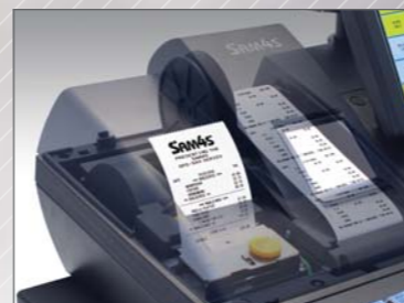
■ The SPS-500 Series has Single & Twin Station Thermal Printers.