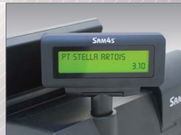
■ The SPS-500 Series has an adjustable Rear Customer Display.